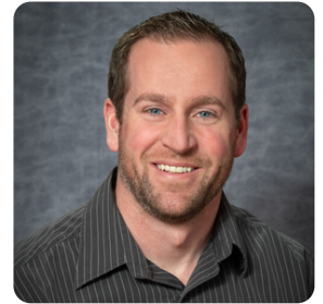
Rural, Prince Coun. Pat MacLellan Rural Municipality of Miscouche