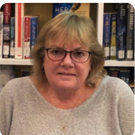
Rural, Kings Coun. Pam Oickle Rural Municipality of Murray Harbour