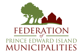
Vacancies Prince County Representative Kings County Representative