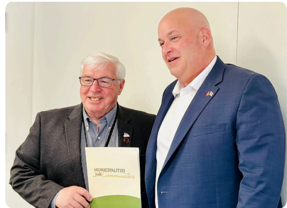
Meeting with Minister Kent Dollar