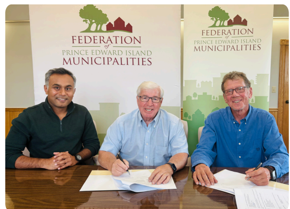
Signing of first MIF funding agreement