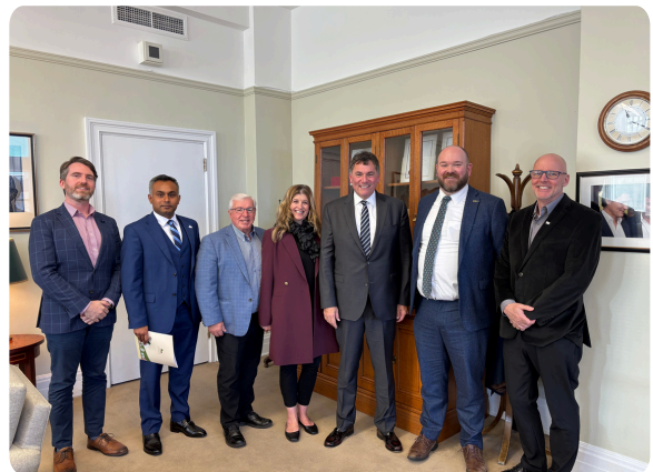
Atlantic meeting with Hon. Dominic LeBlanc