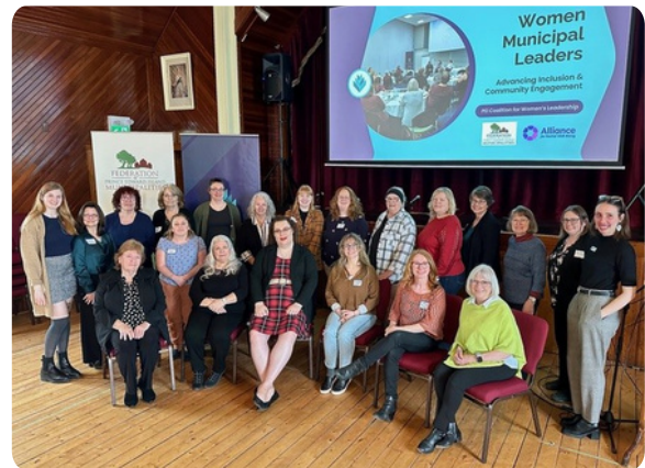
Fostering Resilience in Women Municipal Leaders