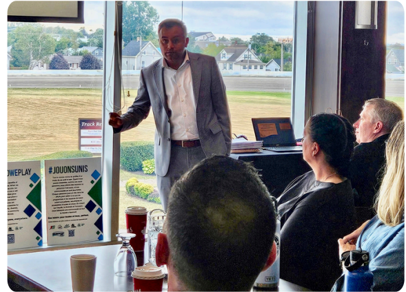
Presentation to Recreation PEI AGM