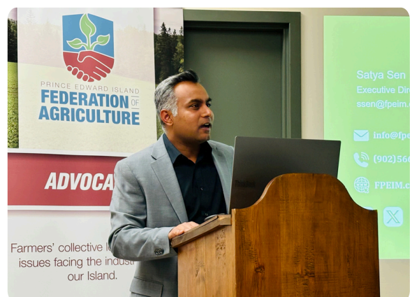
Presentation to PEI Federation of Agriculture Meetings