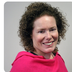
Rural, Queens Mayor Helen Smith-MacPhail Rural Municipality of West River